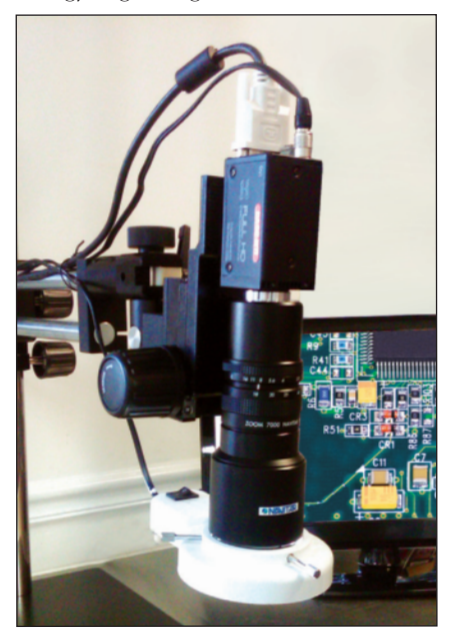
Figure 1. HD camera system designed by Dage-MTI for a circuit board inspection application.

One application utilizing the newest HD camera system involves the quality control (QC) inspection of circuit boards at an industrial manufacturing plant. The original QC process involved three inspection stations with the line inspectors looking through the eyepieces of stereo microscopes with typical magnification of 7x to 40x. Because the employees were required to wear safety glasses, this made viewing images through the microscopes even more difficult and often resulted in eye fatigue. The decision was made to remove the three microscope stations on the inspection line and replace them with the newest single-chip CMOS camera technology, e.g. a high definition, real-time