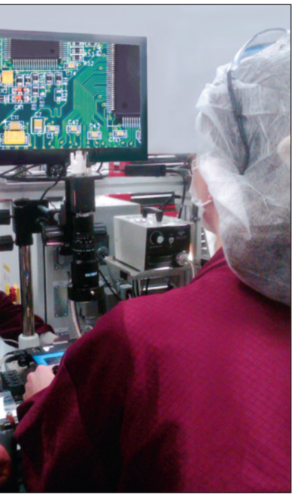
Figure 2. Circuit board inspection line utilizing the new HD-210D imaging system.

The circuit board manufacturer has employed the Dage-MTI HD-210D high definition single-chip CMOS camera, with a Navitar Zoom 7000 Macro-Zoom lens, a Schott-Fostec annular fiber optic ring light with polarizer, and a high definition monitor. The illuminator provided a uniform light source which eliminated the unwanted shadows from the circuit board while the polarizer used on the light source and camera lens pre-