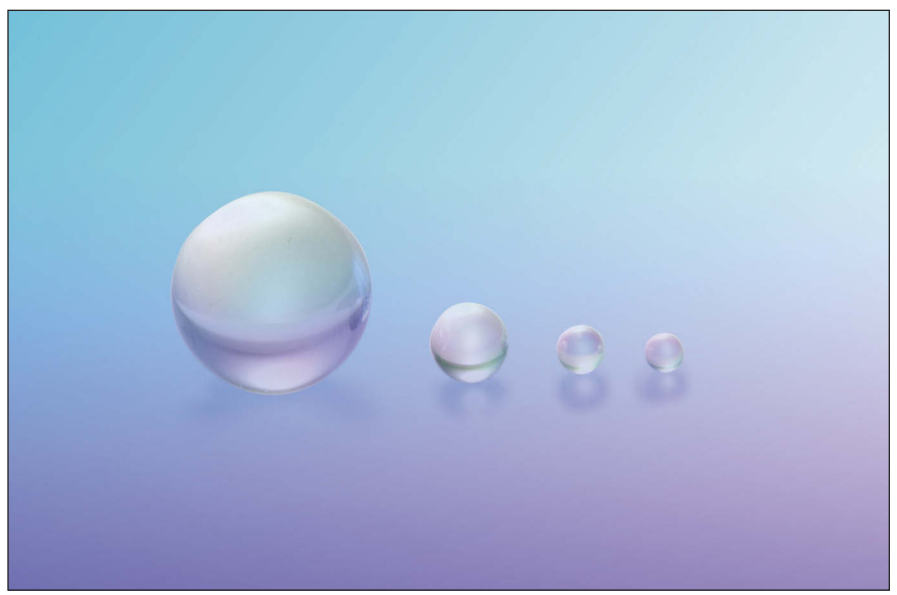
Figure 3. Ball lenses used in fiber-optic coupling systems with AR coating.