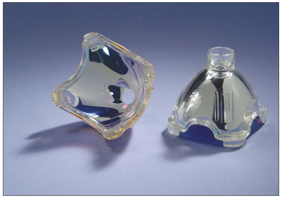
Figure 4. Example of cold mirror reflectors coated by IsoDyn LPCVD process.

Today, ball lenses are finding use in new fields beyond fiber coupling. One area of increasing interest is in the field of concentrated photovoltaic (CPV) power generation. Placed at the center of an array of mirrors, a large-diameter ball lens can be used to focus solar energy onto a high-efficiency solar cell. This system takes advantage of the optical properties of ball lenses to collimate diffuse light into a tightly focused beam. The application of an antireflective coating can be used to improve system efficiency by up to 6.5% through minimization of reflectance losses. The IsoDyn LPCVD process is